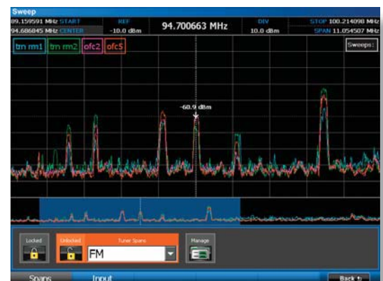
Zoom to a frequency range while continuing full peak capture