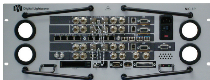
NIC EP Chassis*

Weight - NIC EP: 14.5 - 25 lb, depending on configuration