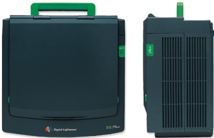
NIC Plus Chassis*

With five-slots available, the NIC Plus provides telecom and datacom testing in one chassis, capable of unmatched multi-port configurations as well as jitter and wander testing.